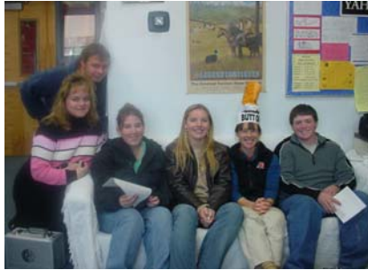
Ronan High School Students Recording Radio Announcements!

Lake County students from Ronan High School, Senior Project class; Polson High School Student Council; and students from the Tobacco Education Group class recorded announcements that were aired on KERR and KQRK radio November 16th—November 18th.